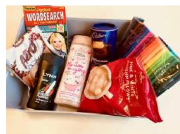
Resident welcome pack

Once you've moved into Bonner House, a family worker will spend time with you, completing an admissions pack which will help you learn more about Bonner House. If at any time you have a question, always ask.