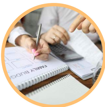
Budgeting and money