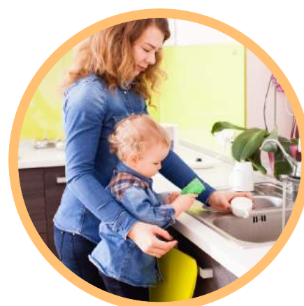
Hygiene and housework planning