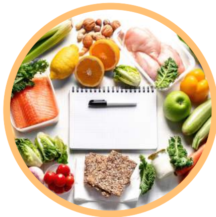
Cooking and meal planning

There are lots of sessions available and opportunities to develop your skills at Dudley Lodge, some of these might include: