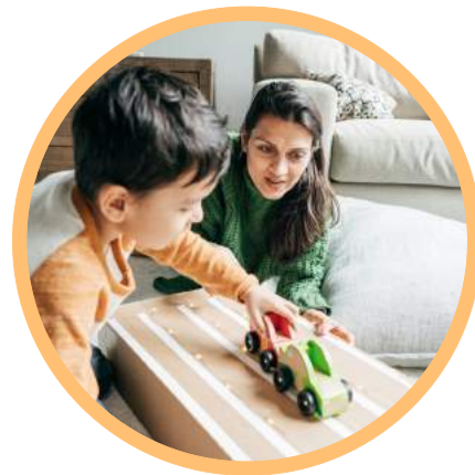
Child safety and protecting them from harm