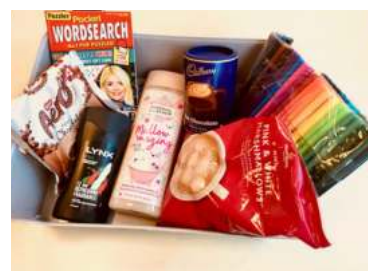
Resident welcome pack

Once you've moved into Dudley Lodge, a family worker will spend time with you, completing an admissions pack which will help you learn more about Dudley Lodge. If at any time you have a question, always ask.