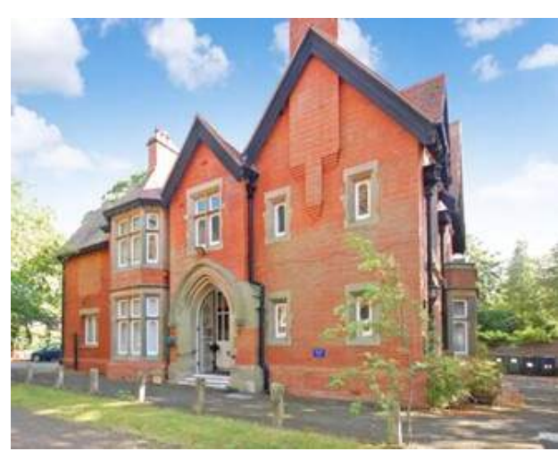
Saxon House, Wolverhampton

Dudley Lodge is a non-profit charity. We have three assessment Centres, Dudley Lodge in Coventry, Bonner House in Birmingham and Saxon House in Wolverhampton. This booklet is all about Saxon House, Wolverhampton. Parents come to us through a referral, this referral will be made by the local authority. Following a successful referral, you will then come to us for an assessment.